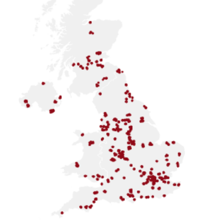
Figure 1: UK addresses sampled to participate in ESS Round 6 (2012/13)

The European Social Survey is an academically driven survey of public attitudes and opinions conducted in more than 20 European countries every two years since 2001 (<u>www.europeansocialsurvey.org</u>). For this analysis we use Round 6 of the survey conducted in 2012/13 and focus on the UK. The ESS sample in the UK consists of 4,520 addresses sampled from the Postcode Address File to provide a nationally representative sample. Interviewers then make a random selection from amongst the household members on the doorstep. In common with most face to face surveys conducted in the UK, the ESS sample points are highly geographically clustered into 220 Primary Sampling Units (based around postcode sectors) to make fieldwork more resource efficient. The implications of this geographic clustering for our analysis will be discussed.