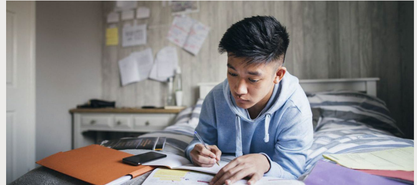
This Photo is licensed under CC BY